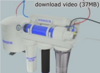
download video (37MB)