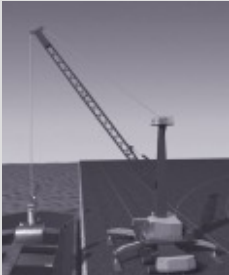
download video (17MB)